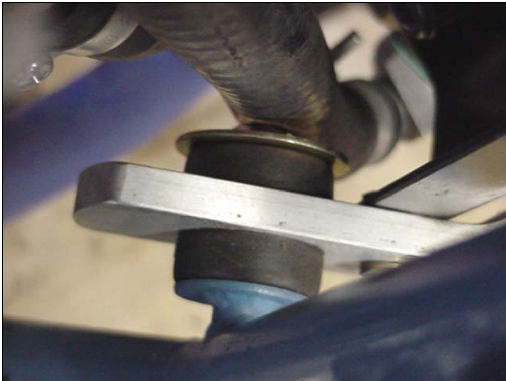
Rear right hose makes overtop the bolt