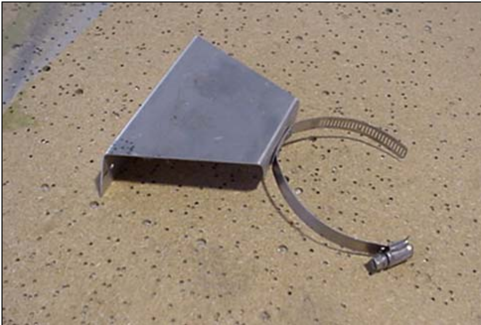
6E6-3 OIL TANK TOP SUPPORT

Bottom support bracket for oil reservoir