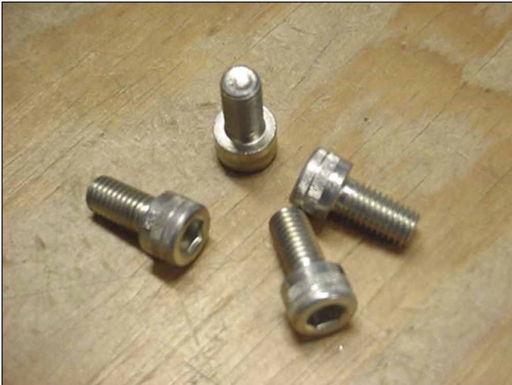
M10x1.5x20 12.9 BOLTS QTY: 4

Drill the head of the bolts with a 1/16" drill bit to safety ties the front bolt to the rear bolt