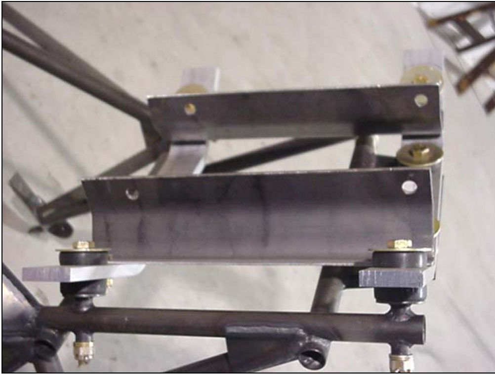
Holes in E1-1X to bolt the engine.