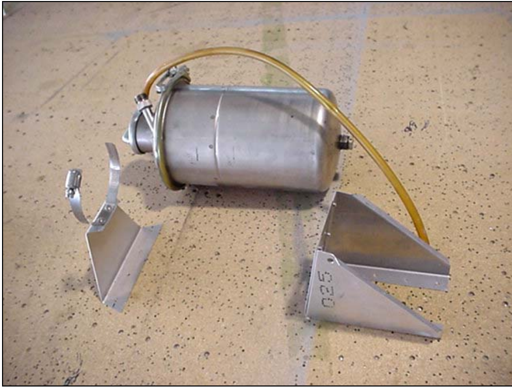
Oil reservoir for Rotax dry sump.