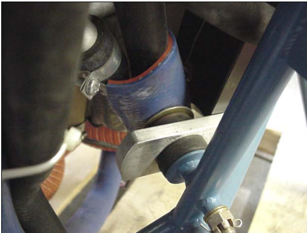
Right rear engine mount bolt

Piece of radiator hose sliced open (approximately 3 inches long)