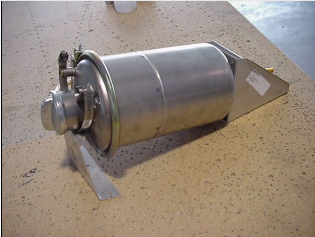
Oil reservoir and brackets